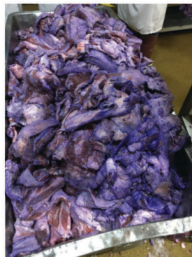
After electrostatic intervention

Elite 360 ® electrostatically applies an antimicrobial intervention to cover the product, using the least amount of antimicrobial possible, while still being as effective as possible. Transfer efficiency, the ratio of antimicrobial applied to the meat surface compared to the amount sprayed, was found to approach 90-100 percent in Birko’s testing.