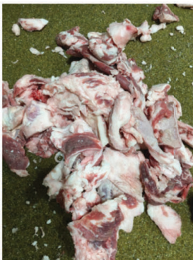
Before electrostatic intervention