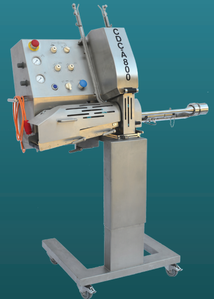
Fully Automatic Cliptechnik CDC-A Series clipper

Cliptechnik Tabletop Clipstar Single and CDC Double Clippers allow users to safely and securely close all kinds of artificial casings as well as all types of bags used in modern sausage production.