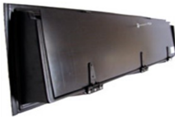
DF-48W2: 4 ft. Deep Angle Ceiling Mount Inlet