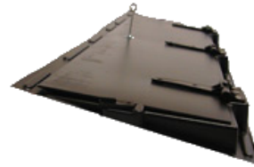
DF-48: 4 ft. Ceiling Mount Inlet