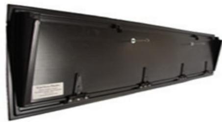
DF-60: 5 ft. Wall or Ceiling Mount Inlet