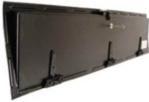
DF-48: 4 ft. Wall Mount Inlet

Whether it is for the standard retrofitting of older buildings or the new wider constructed buildings, WE'VE GOT WHAT IT TAKES!